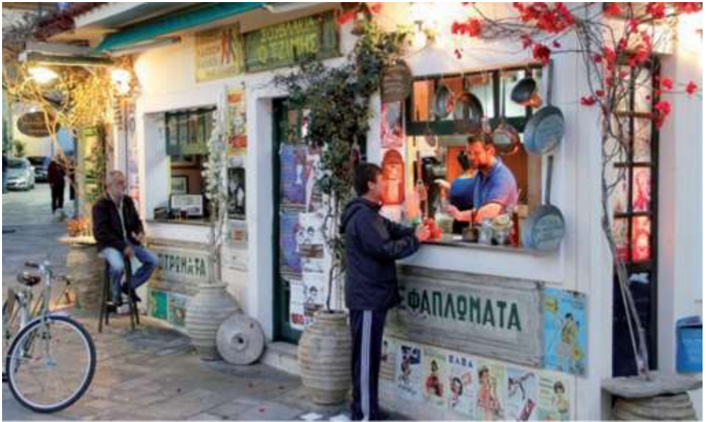
Traditional grill in the historic centre