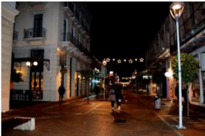
Typical pedestrian street downtown

Kalamata is a modern city with a wide variety of entertainment venues, fun and food for all tastes and all ages. Guests can choose among cafes, internet cafe, clubs, bars, eateries, bowling, billiards, etc. In summer, most prefer to take a stroll or enjoy themselves along the beach. In winter, on the contrary, the busiest parts of the city are the square and the historic center. In the city there are many pedestrian streets where guests can enjoy a stroll around the shops.