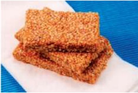
Sesame seeds bar (pasteli)