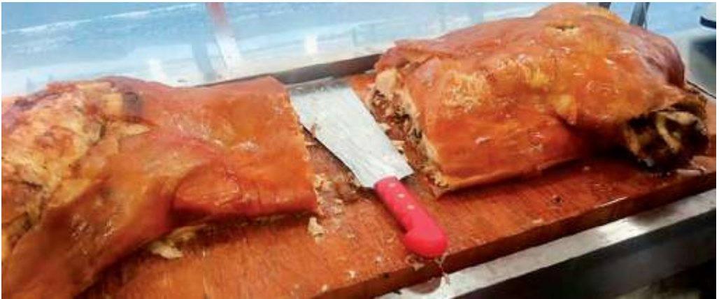
Gournopoula (a whole crispy porky)

Diples (a dessert made of thin sheet-like dough covered by honey) Dried figs